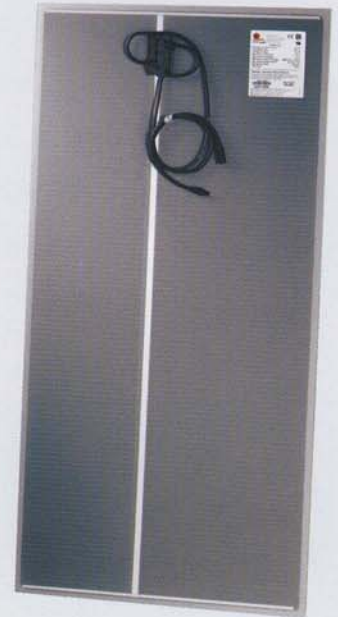
FS Series 2 Solar Module