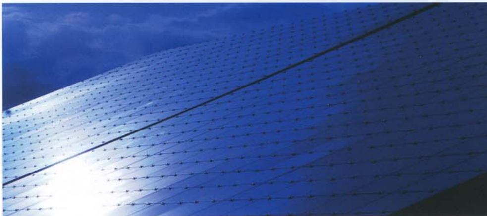
Commercial Solar Power Plant

First Solar's FS Series 2 PV Modules represent the latest advancements in thin-film solar module technology. The Series 2 modules are IEC 61646 and Safety Class II (SK II) certified for use in systems up to 1000 VDC. First Solar provides cost effective thin-film module solutions to leading solar project developers and system integrators for large scale, grid connected solar power plants. First Solar application engineers provide technical support and comprehensive product documentation to support the design, installation, and long term operations of high performance PV systems.