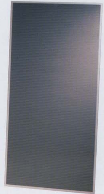
FS Series 2 Solar Module