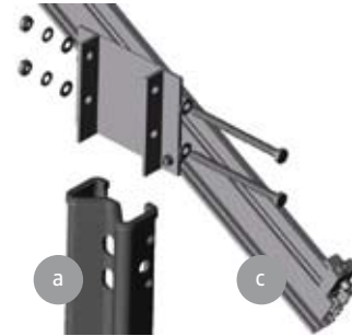
Detailed view of the pre-assembled adapter